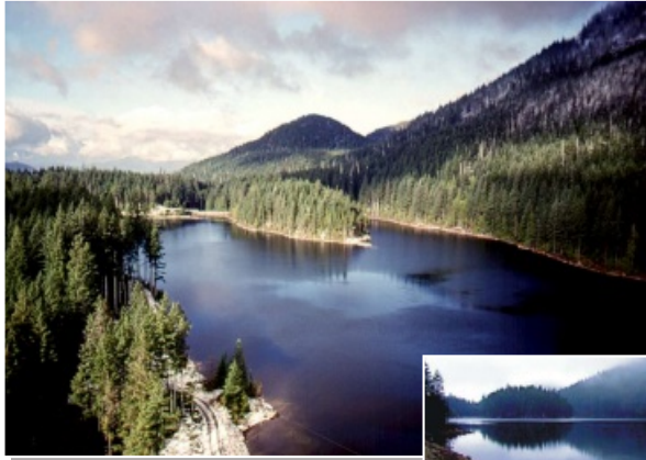
Eagle Lake High Elevation Source*