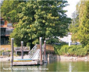
North Vancouver Marine Access