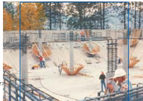
Inverted Pyramid Shape. City of Penticon Duncan Avenue Reservoir