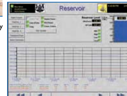
Monitoring Reservoir Level by SCADA. District of Houston