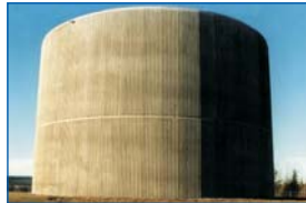
Concrete Reservoir with Architectural Finishing. City of Prince George Danson Reservoir