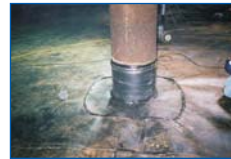
Leakage Repairs Using a High Density Polyethylene Liner. District of West Vancouver Upper Nelson Reservoir