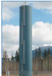
Standpipe Coated Steel Water Storage Reservoir. Kispiox Band