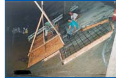
Lining Repairs where Large Voids were Uncovered. District of West Vancouver Crosscreek Reservoir