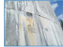
Leakage Repairs to Correct Freeze Thaw Action. City of Prince George La Freniere Reservoir