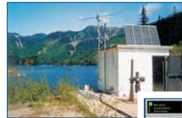
Solar Powered SCADA Security Monitoring. City of Abbotsford Dickson Lake Reservoir