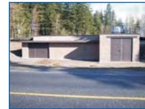
Seismic Repairs of Existing Reservoir Facilities. City of Campbell River Evergreen Road Reservoir