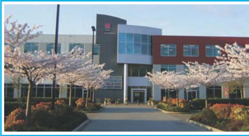
Head Office - North Vancouver

King County, Washington State Design/Build of the Brightwater Marine Outfall