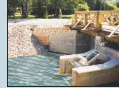
Automated Water Level Control Surface