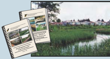
Policies and Bylaws