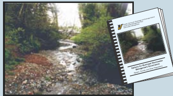
Structural and Non-Structural Solutions