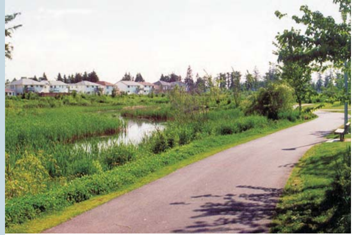
Award Winning Fishtrap Creek Engineered Wetland Abbotsford, BC