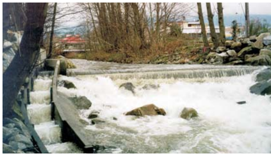
Mosquito Creek, North Vancouver, B.C.

King County, Washington State Design/Build of the Brightwater Marine Outfall